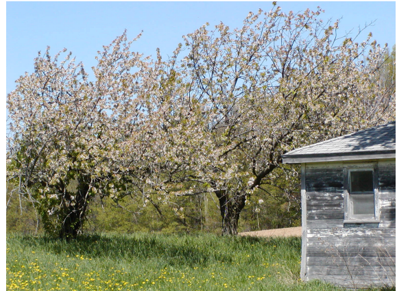
Even an old shack and apple trees in blossom becomes an image of rural beauty in the Michigan spring.