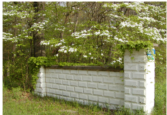
A simple white wall becomes a "still life" painting set off by the blooms of the white native dogwood.

DON'T MISS ALL THE FUN ON PULLMAN PRIDE DAY SATURDAY JULY 21 ST !